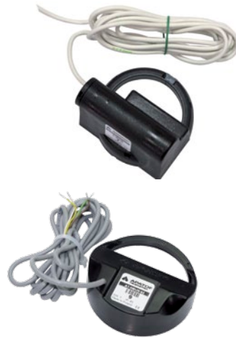
PULSE OVERLAY AT-MBUS-NE-01 / AT-MBUS-NE-03